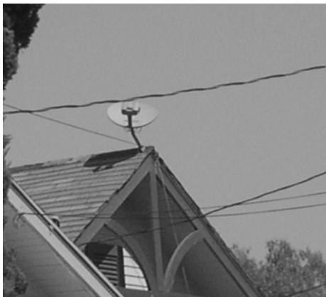
Satellite television dishes and other mechanical appurtenances should be located to the rear of a structure.