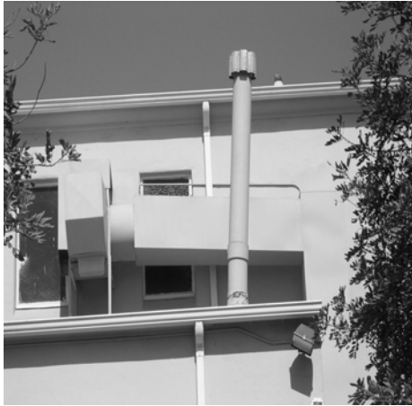
Mechanical apparatus may be installed in areas visible from the public way if there is no other technically feasible location for installation.