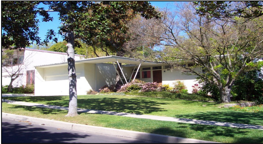
The Historic Context Statement will ground the survey's assessments within a comprehensive framework detailing Los Angeles' key property types, such as the post-World War II Modernist housing found in the Gregory Ain Mar Vista Tract HPOZ.