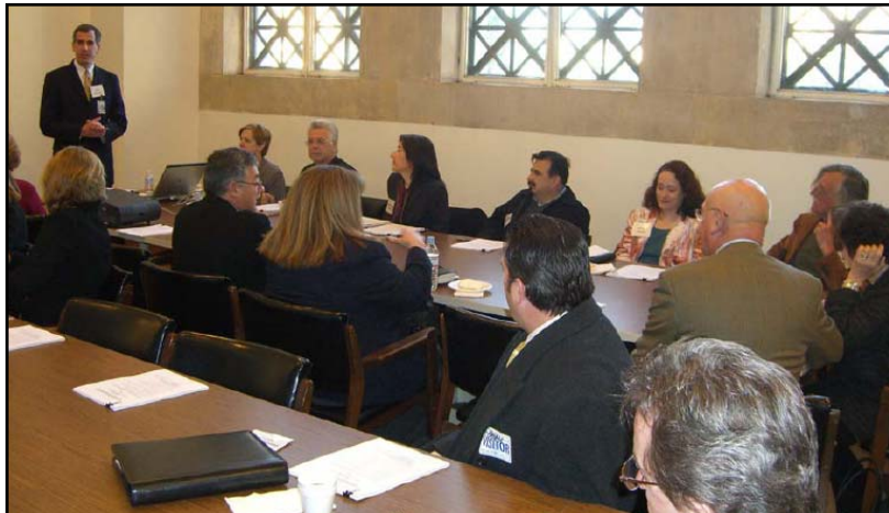
The Office of Historic Resources has created a 25-member Survey Project Advisory Committee, shown here at its first meeting, to provide ongoing input from Los Angeles’ business community, neighborhood leadership, and top preservation professionals.