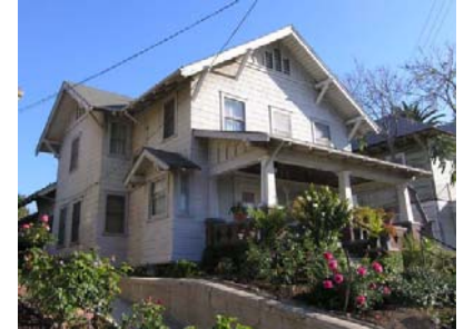
A Mills Act property within the Angelino Heights HPOZ.

A recent Los Angeles Times article featuring the Mills Act has brought a great deal of attention to the pro-