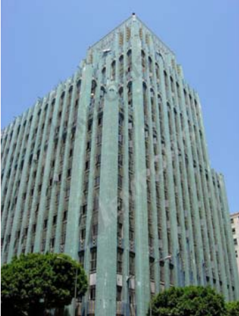
Eastern Columbia Building— A Mills Act property in Downtown's historic core that has been adaptively re-used as live-work units.

Los Angeles for a revolving ten-year term, agreeing to restore, maintain and protect their property in accordance with historic preservation standards in exchange for a potentially significant reduction in property taxes. Qualifying proper-