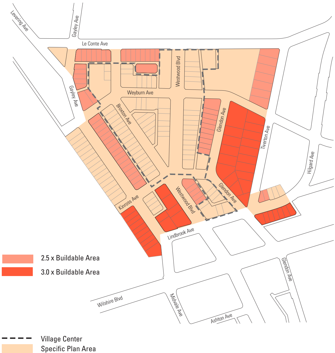
Figure 3 Maximum Permitted Floor Area (Base (2.0) plus Additional)