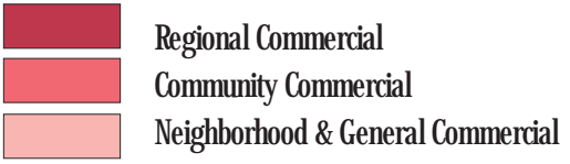
Map 1 - Woodland Hills Section Plan Designations