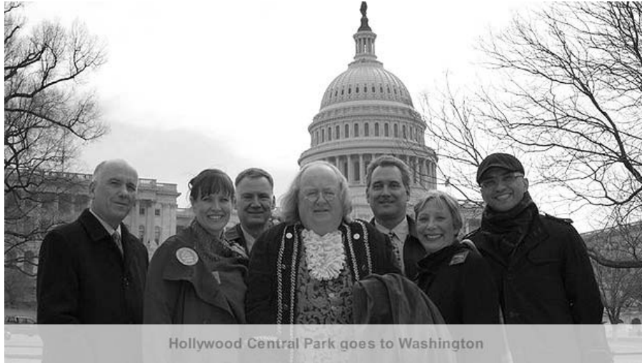
Hollywood Central Park goes to Washington