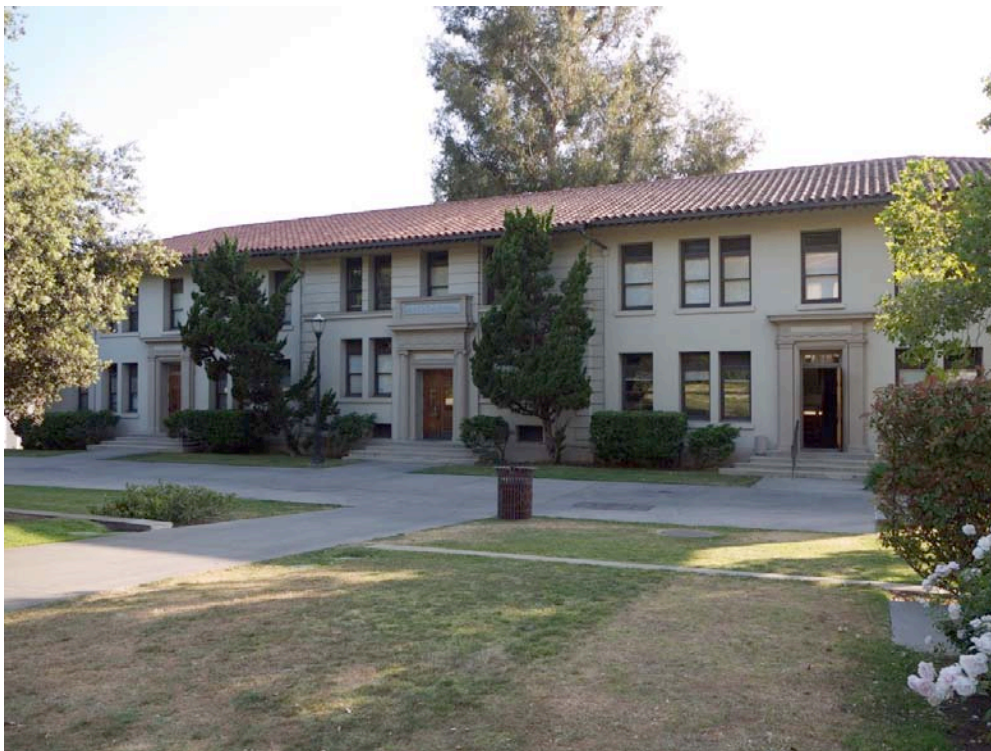
Figure 2-4: View of Swan Hall from Quadrangle from the Northeast