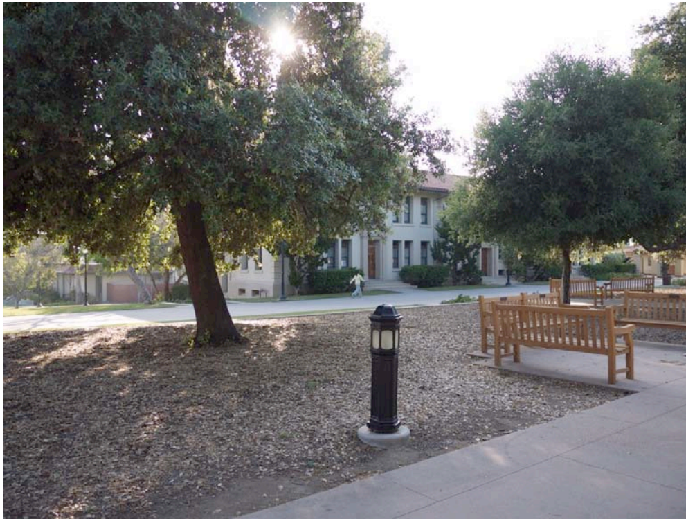
Figure 2-3: View of Swan Hall from Quadrangle from the Southeast