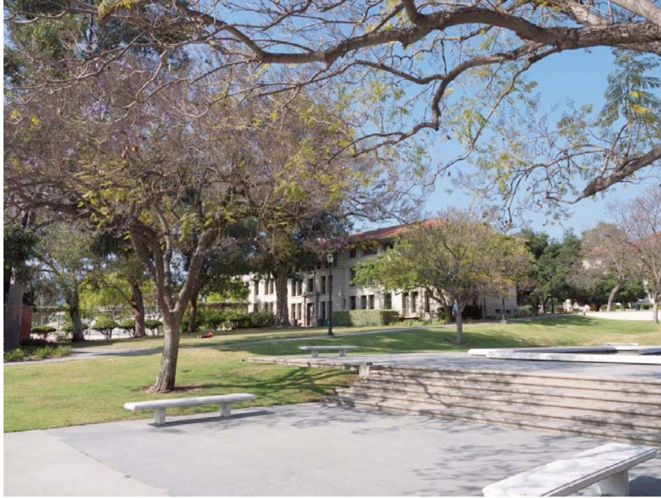
Figure 2-5: View of Swan Hall and Addition Site from the Southeast