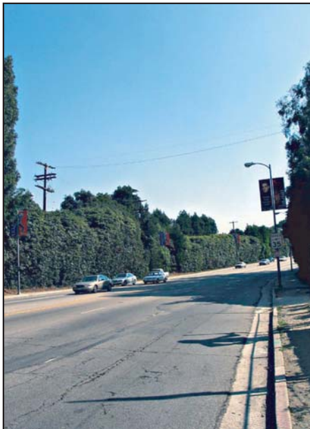
View 8: Looking east along Wilshire Boulevard from the northwest corner of the project site. The Los Angeles Country Club is located behind the trees that are shown here along Wilshire Boulevard, both on the northern side of the street and on the southern side.