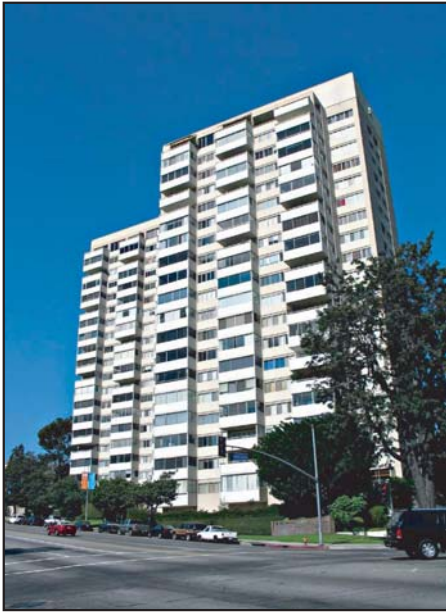
View 6: Looking towards the northwest corner of Wilshire Boulevard and Comstock Avenue at The Comstock, a high-rise condominium complex that consists of two 20-story residential towers.