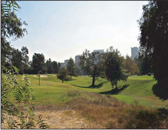
View 9: View of the Los Angeles Country Club golf course to the east of the project site. The golf course is secluded by dense trees and vegetation that surround its perimeter; thus, it is not directly visible from the project site.