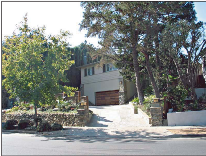
View 11: Looking south from the project site at a two-story, single-family home located on the south side of Club View Drive.