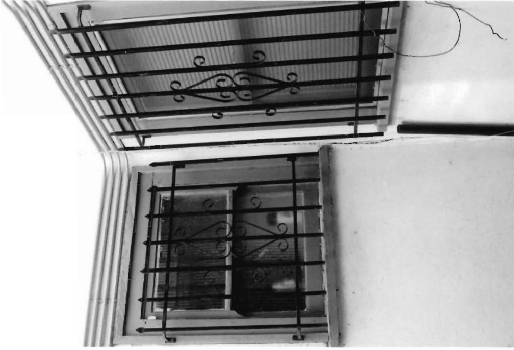
Representative original one-over-one wood frame double hung windows.