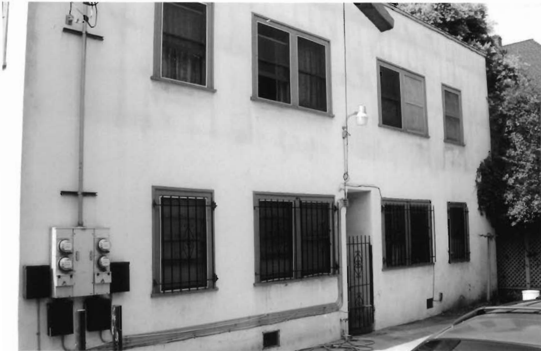
North/rear elevation of four-plex: Gated entry to interior court, viewed to southwest.