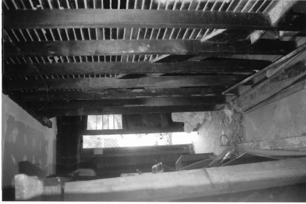
Original garage interior wall, viewed to north.