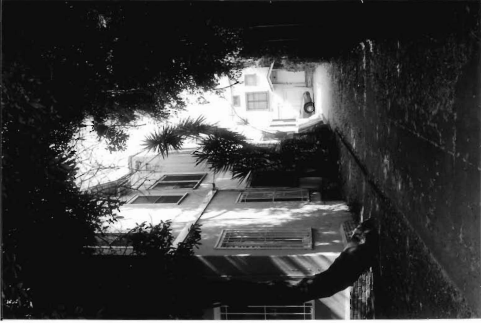
View along driveway: East elevation front building and south façade rear building.