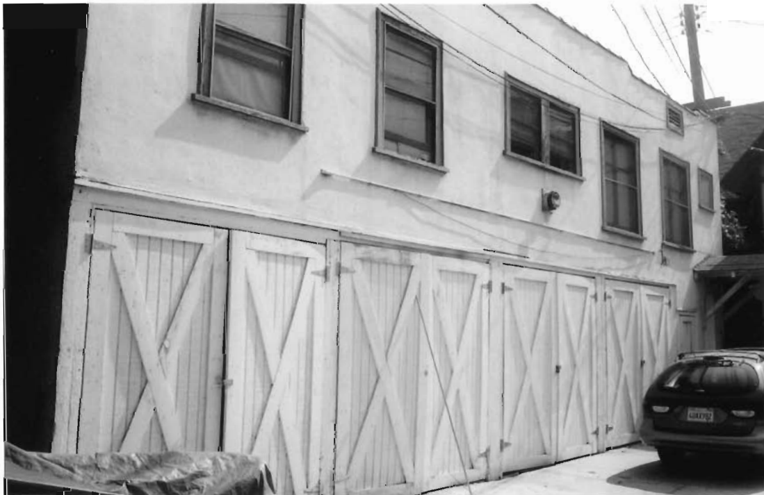
South façade, garages and upper unit: Viewed to northeast.