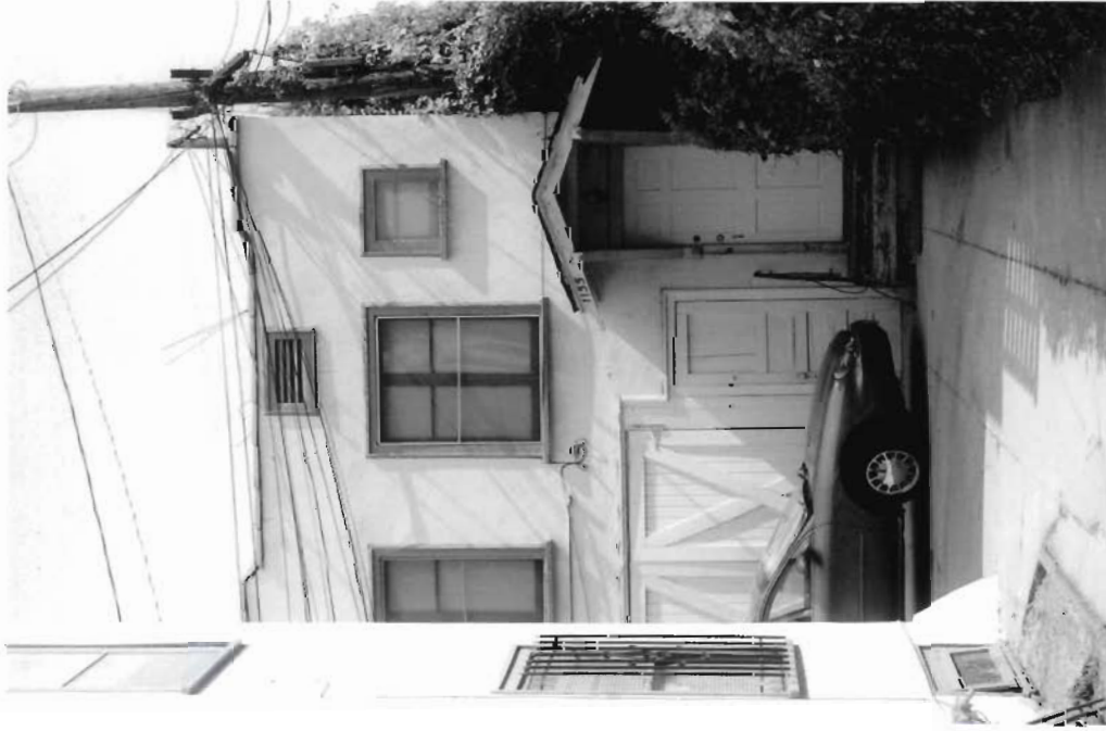
Northeast corner of four-plex and southeast corner of garage with rear unit entry, viewed to north..

Jessie D'Arche Apartment Residence 1155-1157 West 27 th Street, Los Angeles, CA 90007 Photo date: November 2006 ~ © Anna Marie Brooks 2006