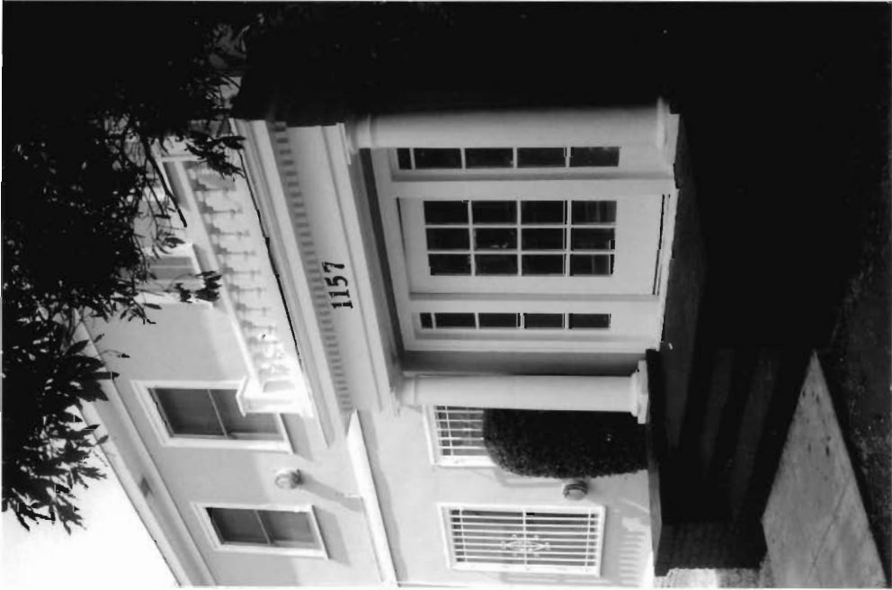
South façade entry: Viewed to northwest