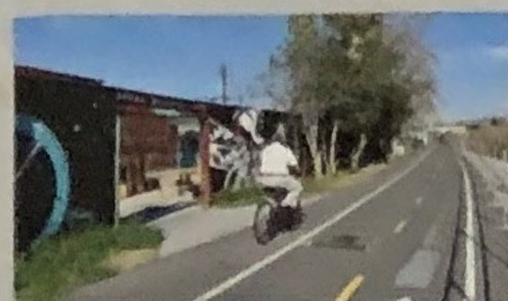
Bike/Ped Path Accessibility Acceso a la Pista Ciclista/Peatonal