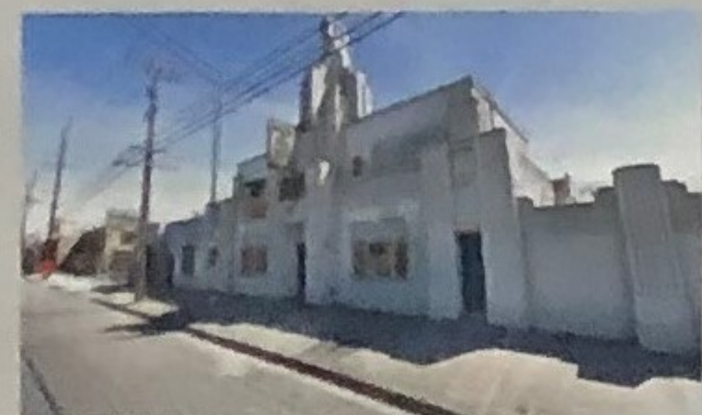
Architectural Features Características arquitectónicas