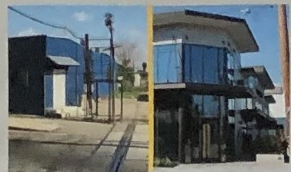
Scale & Placement Tamaño y Ubicación