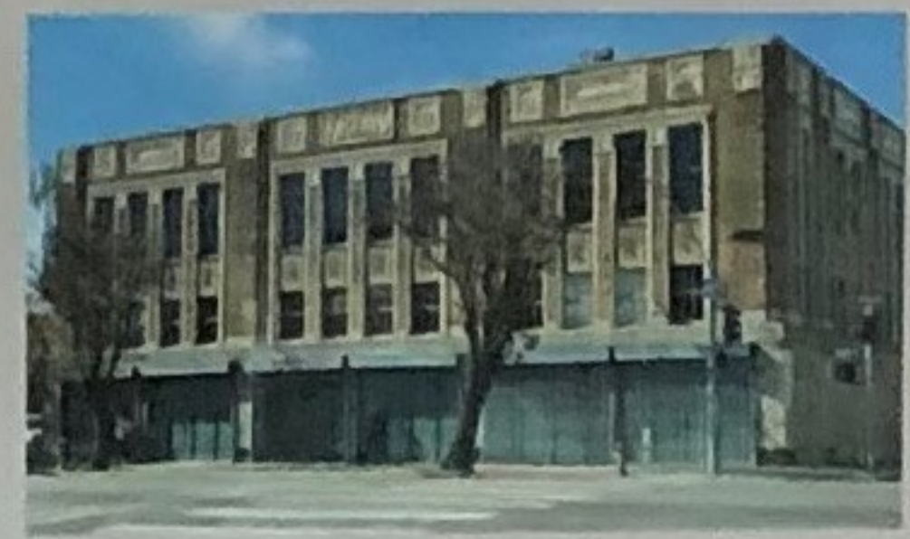
Ground Floor Transparency Transparencia en la baja planta